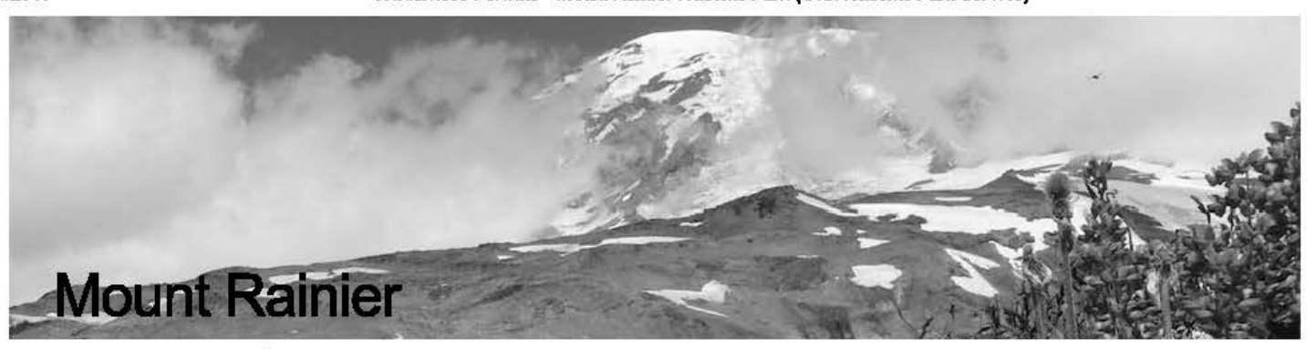
National Park | Washington